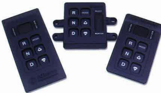
6TH GEN PUSH BUTTON SHIFT SELECTORS

As a world leader in medium- and heavy-duty commercial transmissions, Allison Transmission continues its ongoing improvement initiative with the introduction of 6th Gen Electronic Controls Shift Selectors.